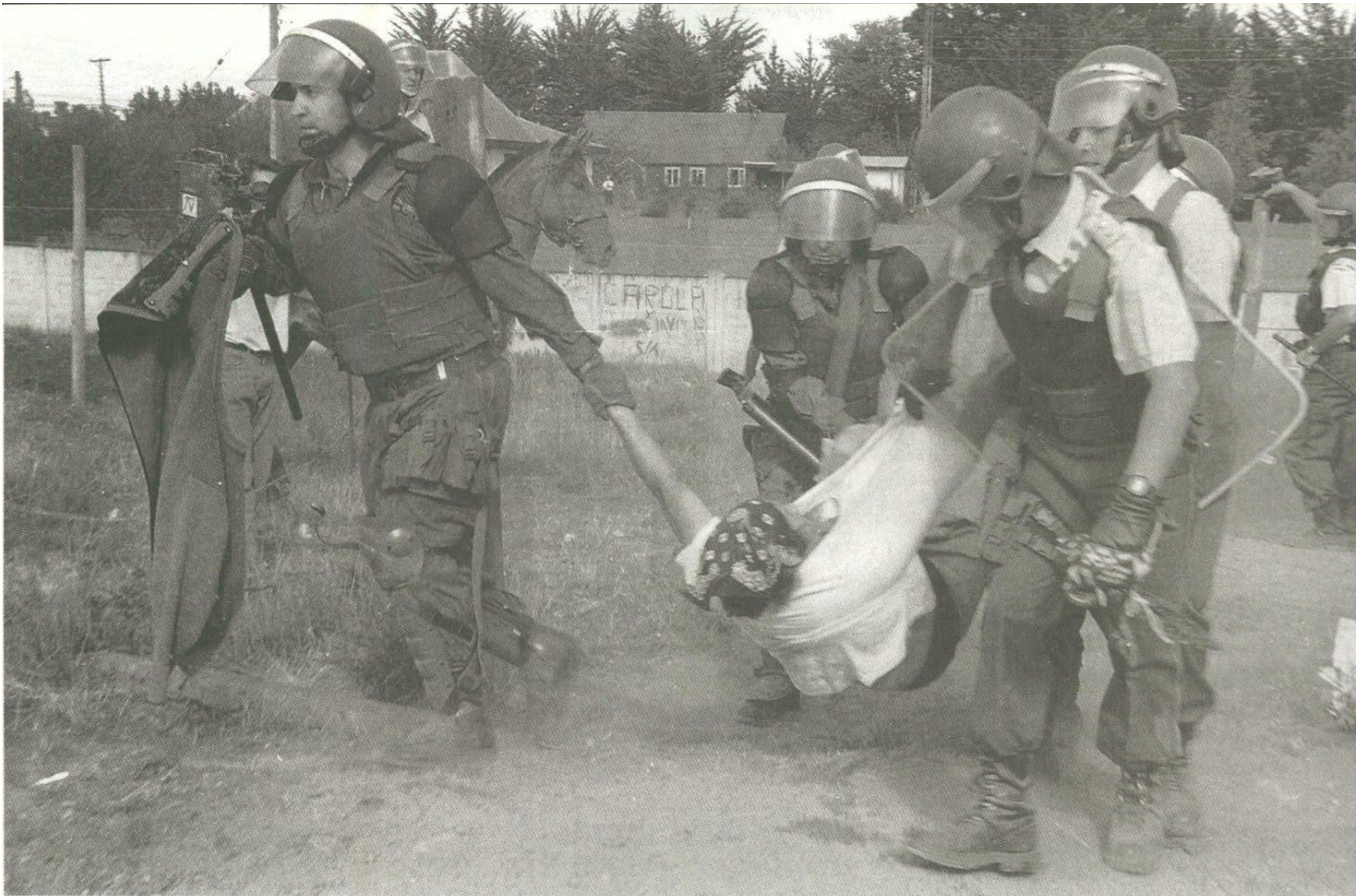
Police drag a woman during a raid of the FFEE (Police Special Forces), in the community of Juan Currin, Temuco, Araucanía Region.