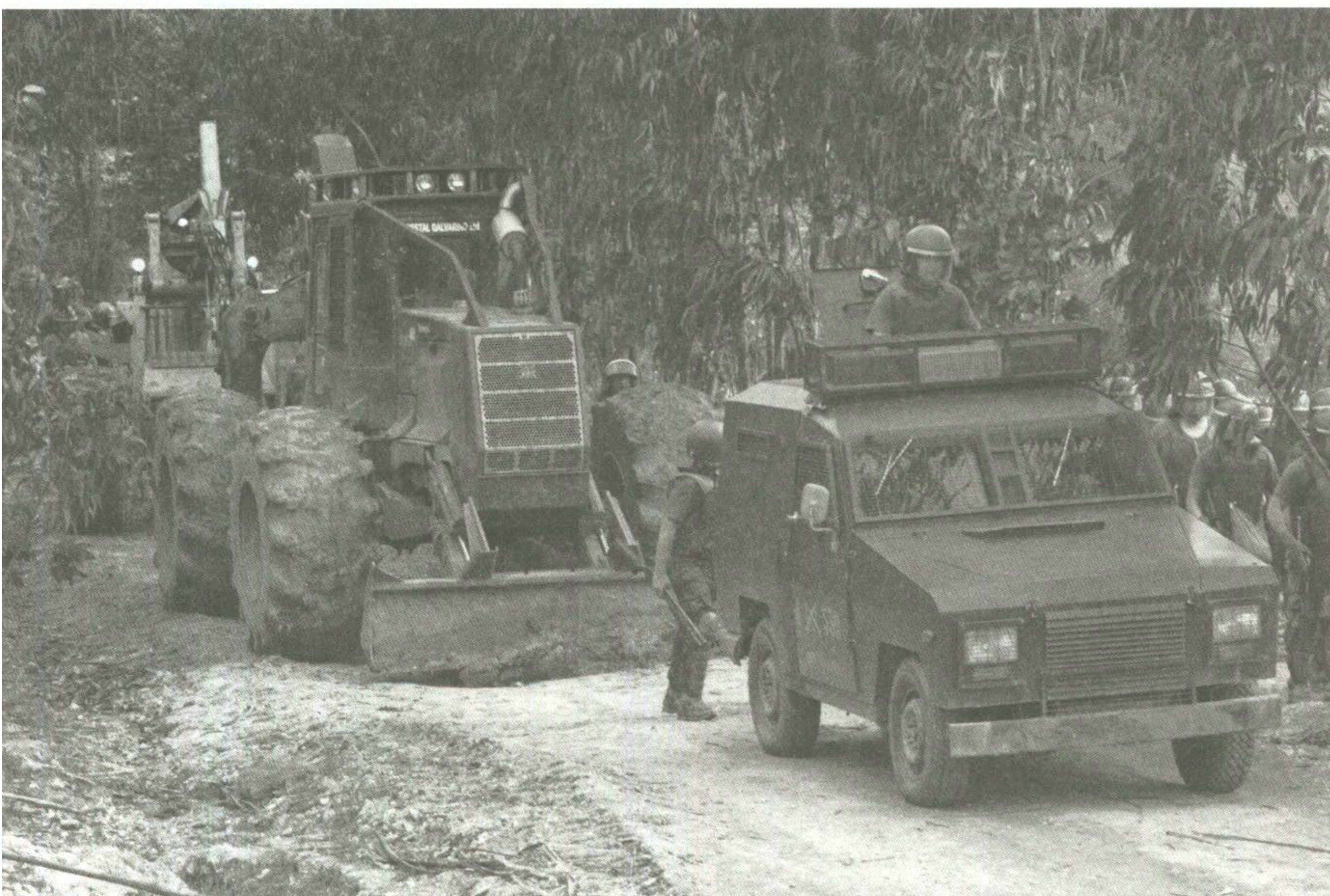
Chile's Special Forces squad on the Temukuykuy Reservation, Malleco Province, Araucanía Region.

7. Pedro Cayuqueo, "Nómina de detenidos desaparecidos y ejecutados políticos del Pueblo Mapuche," Azkintuwe , Sept. 9, 2011, http://www.azkintuwe.org/20110911_006.htm .